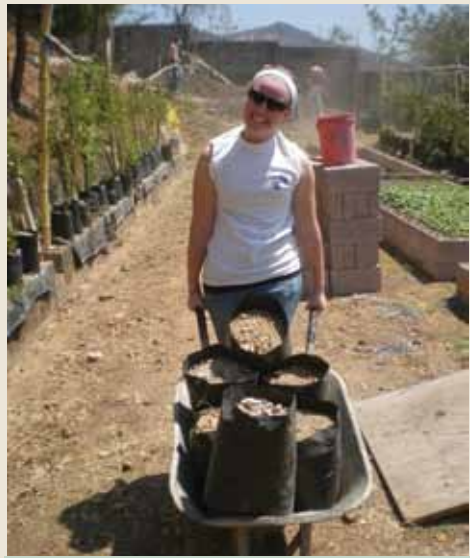
Ohio Dominican University student helping to create a garden at El Cedro in El Salvador

In recent years we have been privileged to share our mission with individuals and groups from a number of colleges and universities around the country.