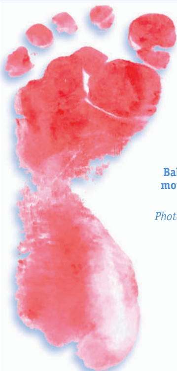
Baby's footprints for a mother's Memories and Milestones Book