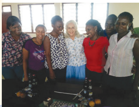
Some current & former staff members at St. Patrick's Dispensary