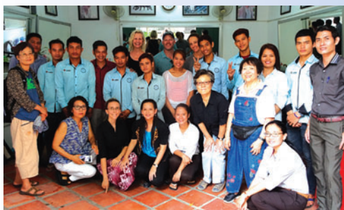
The Friends Across Borders group with the Deaf Development Program participants

During our daily shared prayer and meditation times, our group tried to connect the disparate parts, the narratives of individual and cultural trauma, with the hope and inspirational drive for healing and restoration that we saw. At this intersection is where we found the transformational work of the Maryknoll Lay Missioners in Cambodia.