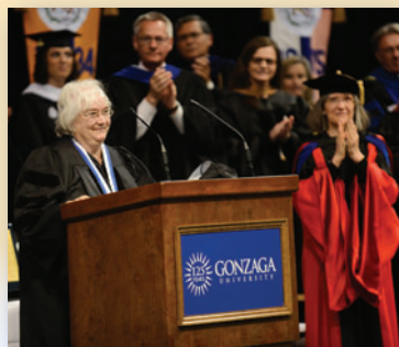
Giving the Commencement Address at Gonzaga University in 2012