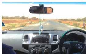
(Left) Old Road to Taveta in 2013 (Right) New Road to Taveta in 2017