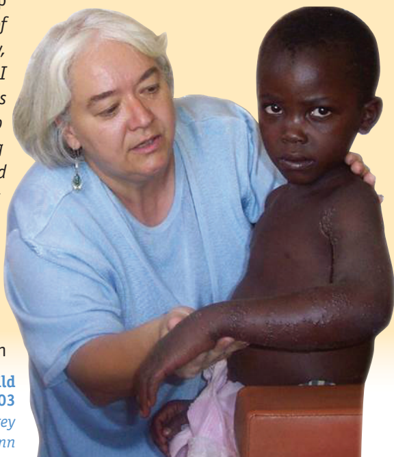
Attending to a Kenyan child with shingles in 2003