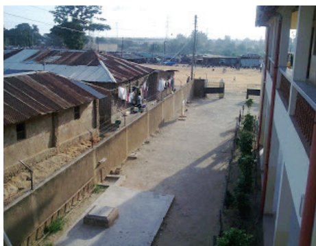
St. Patrick's Dispensary over Bangla Drive