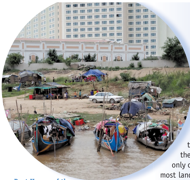
Boat Homes of the Vietnamese Cambodians