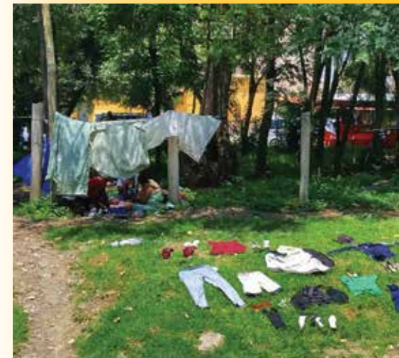
Locals drying their laundry after washing it in the river