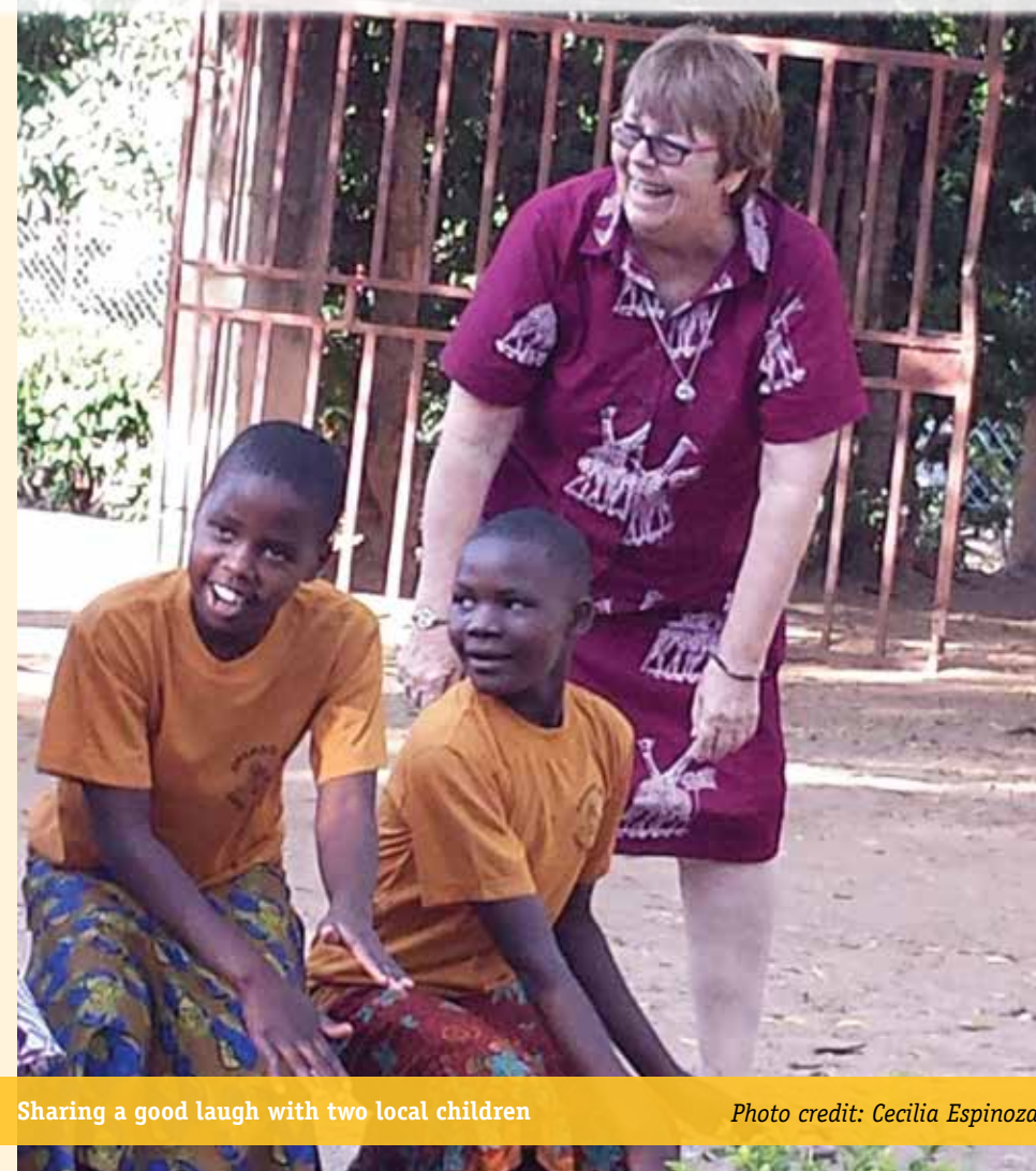
Sharing a good laugh with two local children