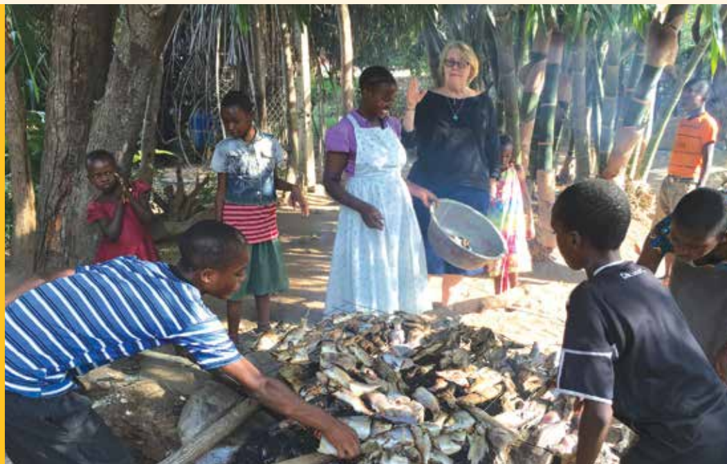
Cleaning the donated fish before cooking them

Female Genital Mutilation, as they locally refer to as female circumcision or “cutting” is performed on young women, usually by their relatives, as a preparation