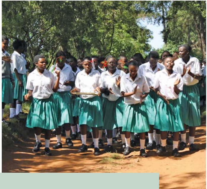
The students of St. Monica's Girls High School help celebrate Catholic Education Day.